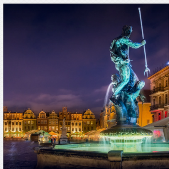
Andersia Hotel by Radisson